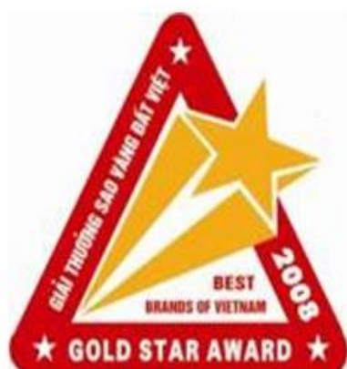
2008 Vietnamese Gold Star Award