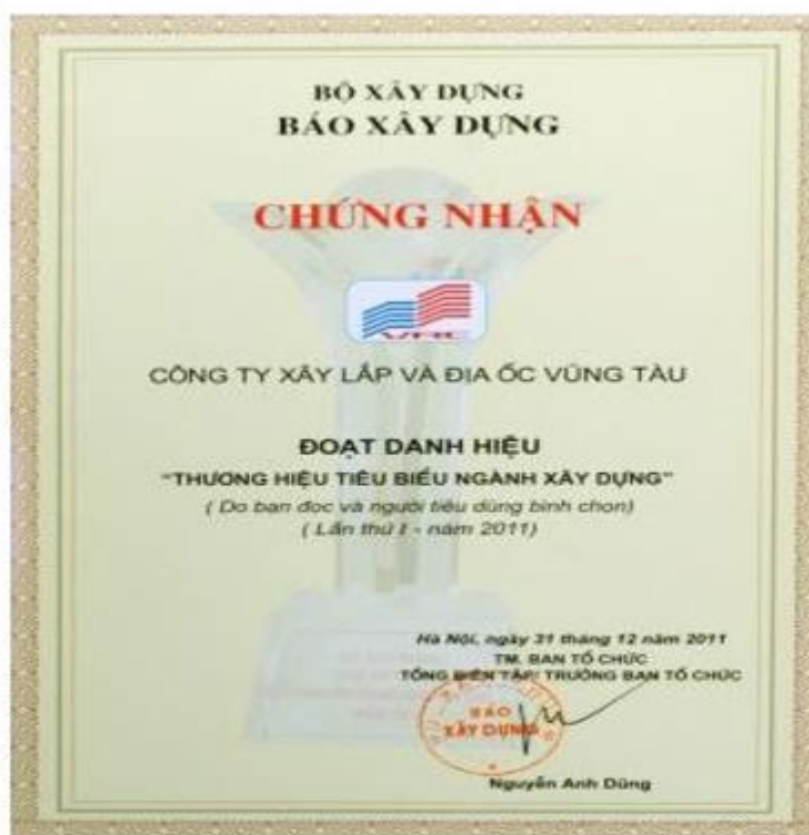
Typical brand of construction industry 2011