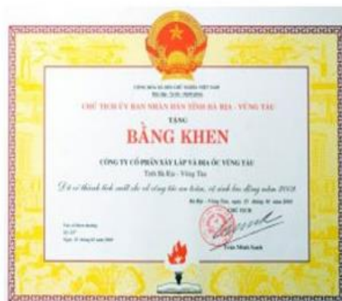
The Merit of outstanding achievements in the work of occupational safety and health 2009