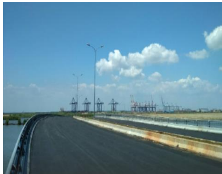
Proposed layout of the target port