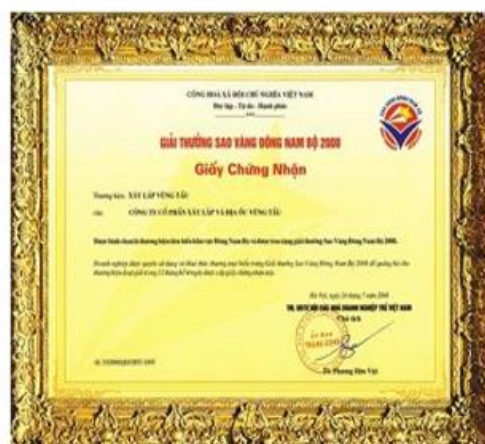
Gold Star of South East Vietnam 2008