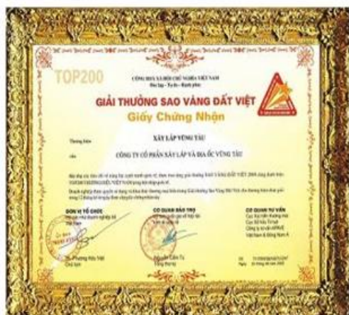
Top 200 enterprises awarded 2008 Vietnamese Gold Star Award